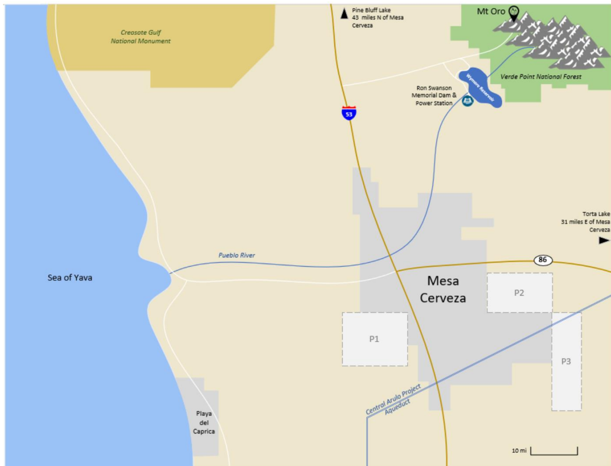
Figure 1: The City of Mesa Cerveza and surrounding area.